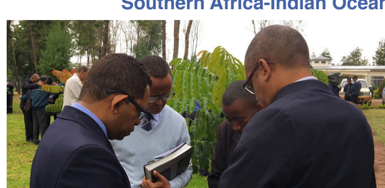
Prayer meeting early in the morning with pastors from the Indian Ocean Adventiste Zurcher, Madagascar. #GodFirst