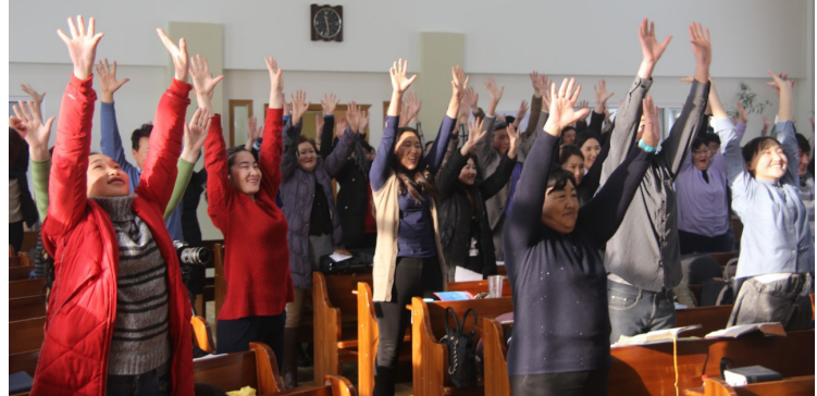
Stewardship training for the newly baptized members in Ulaanbaatar, Mongolia.