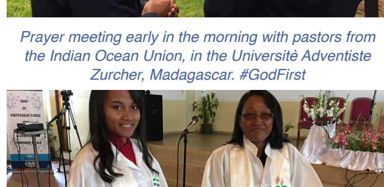
Deaconesses collecting tithes and offerings at the Zurcher Adventist University, in Madagascar.