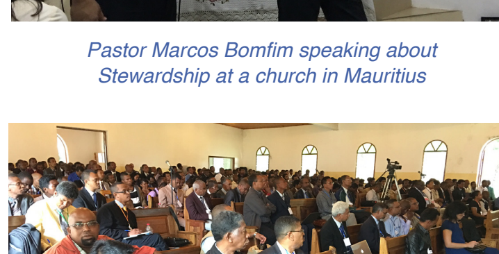
More than 270 pastors attended the SID/Indian Ocean Union Pastoral Convention, in Madagascar.