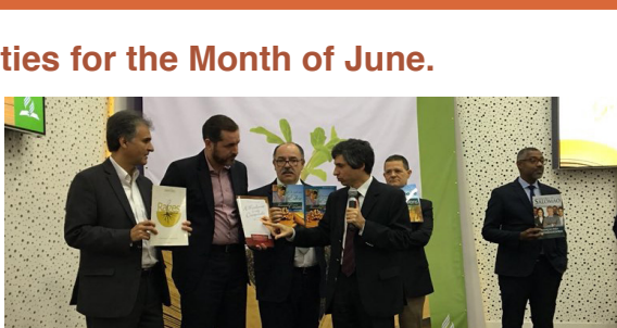
Stewardship Directors at the CBUC in Sao Paulo, Brazil, during a Holy Convocation program, showing new resources.