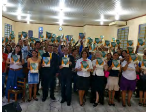
God First is also true for the district of Capanema-PA. All committed to PUT GOD FIRST.