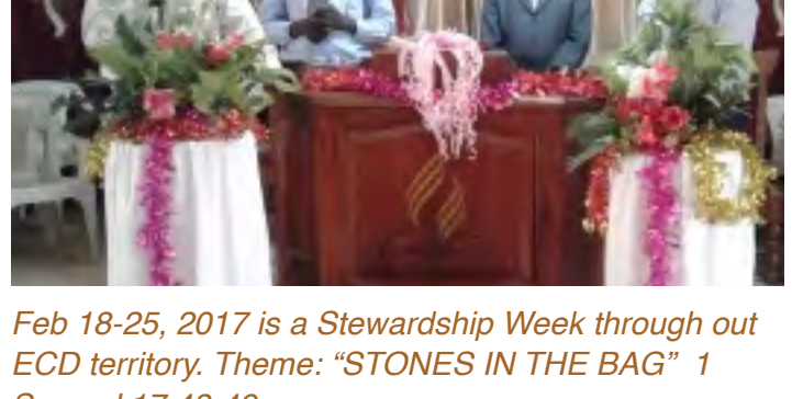
Feb 18-25, 2017 is a Stewardship Week through out ECD territory. Theme: "STONES IN THE BAG" 1 Samuel 17:48-49