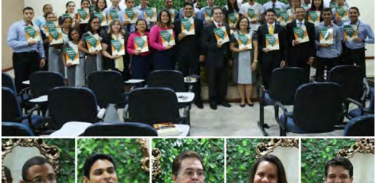
ASPA Servers received the GOD FIRST Spiritual Revival Seminar.