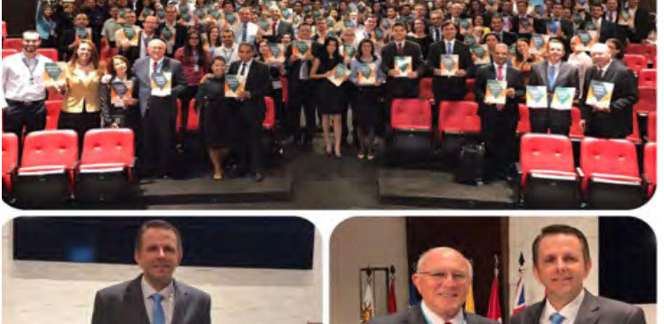
At the SAD worship, we launched THE GODFIRST PROGRAM, a 40-day journey of indepth Bible study.