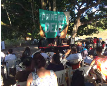
Live Launch of In the UNB DEUS with the presence of its idealizer @ BogerJr @AdvNortePara.