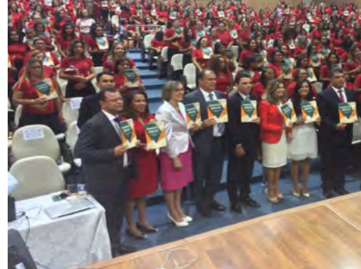
Launching of Working day at the Ministry Convention of the MBN Woman Presence of the Bahia Norte Mission