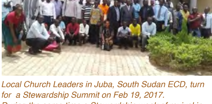
Local Church Leaders in Juba, South Sudan ECD, turn for a Stewardship Summit on Feb 19, 2017. During the same time a Stewardship week of revival in ECD was launched.