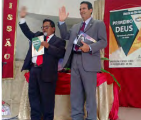
Launching of the Spiritual Day at GODFIRST