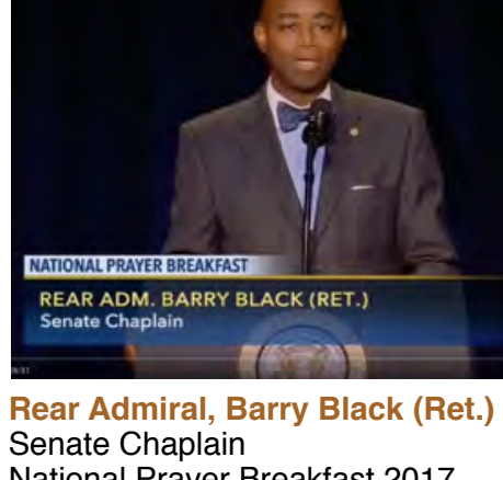
Rear Admiral, Barry Black (Ret.) Senate Chaplain National Prayer Breakfast 2017