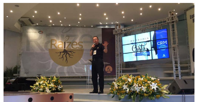
Stewardship Symposium in South American Division