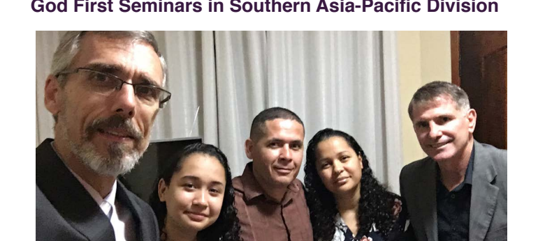
Holy Convocation Visitation in South American Division