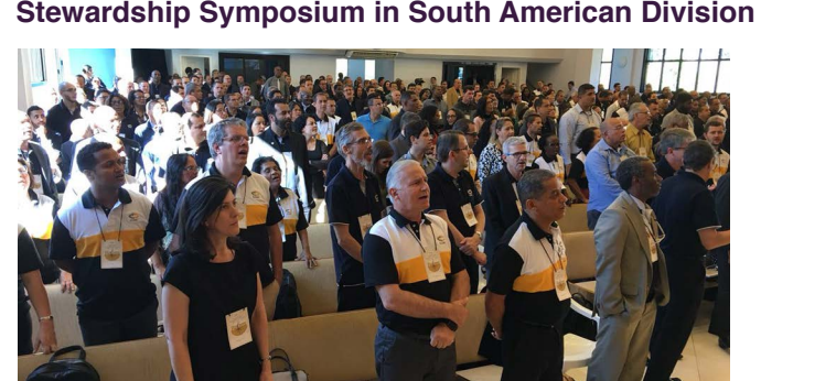
Training of District Stewardship Teams in Rio de Janeiro, Brazil.

Please send us stories, photos, and videos of stewardship events in your region or innovative stewardship ideas. You could be featured in future newsletters! SUBSCRIBE to the monthly God First newsletter via email.