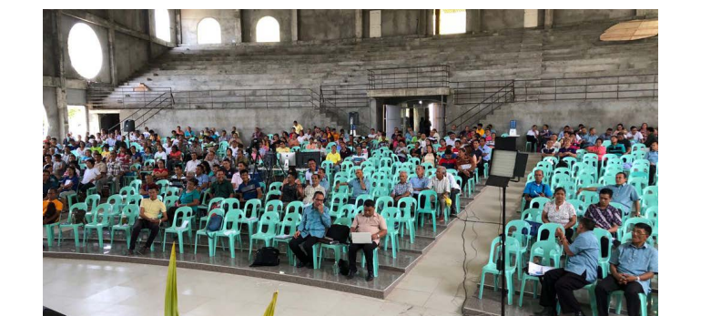
God First Seminars in Southern Asia-Pacific Division